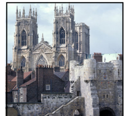
National Conference York 25th September