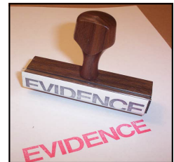
Time Saving Evidence Based Idleness